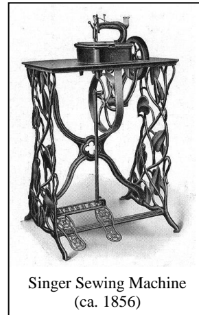
Singer Sewing Machine (ca. 1856)

Singer’s sewing machine was invented in September 1850, and his patent ultimately issued on August 12, 1851. 100 Singer never pretended that he invented the sewing machine ex nihilo , 101 and his patent confirms this. His invention was an improvement on preexisting sewing machines, such as the Lerow & Blodgett machine on which he worked in Phelps’s workshop. Specifically, he claimed and described a sewing machine in which the cloth rested on a horizontal table underneath an overhanging arm containing a vertical, reciprocating, straight eye-pointed needle. The eye-pointed needle was synchronized with a reciprocating shuttle carrying a second thread to make a lockstitch in the cloth, 102 which was held in place by a presser foot as it was stitched. 103 A foot pedal provided continuous